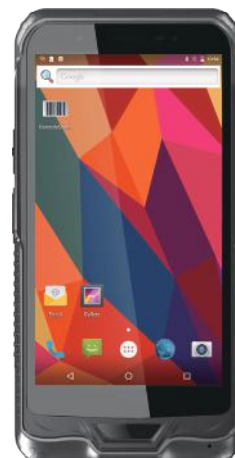
EM-T62 Rugged Handheld

Aiming at the difficulties faced by the hardness tester and the opportunities faced by ERNST, Emdoor Info recommended a rugged handheld EM-T62 for it. It can be perfectly integrated with an ultra-small and high-precision Rockwell hardness tester newly developed by ERNST to form a new wireless portable digital hardness tester which is E-Computest. The system can measure surfaces of different types, materials, shapes and sizes from flat to cylindrical surfaces in any direction. It is simple and convenient, and can be used to measure large parts or outdoors.